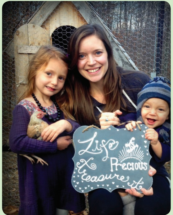
Life is precious, treasure it!