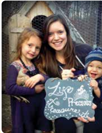
Life is precious, treasure it!

Answer: c) There are no legal protections at any point during pregnancy for unborn babies in Vermont. Search the Vermont Statutes Online and Google the "Bennington Babies" for how the lack of protection can impact families.